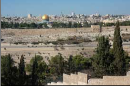
"...If you love the book, you will love the country..."