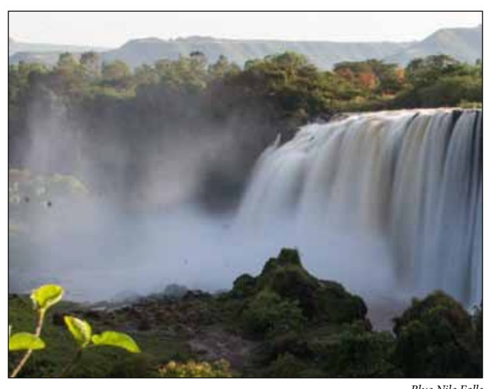
Blue Nile Falls

Drive to the Simien Mountains national park. Early breakfast will save our time to enjoy and have more trekking activity at the most interesting spots of the national park. Sanka ber, Wilkifit Mountatin ranges, Jinbar River falls, further to Chenek, see the troops of Endemic Gelada Baboon, Walia Ibex, possibly the Semein Wolf or Red fox. Will be our games of the day. We will have a lunch Box at one of the most beautiful sceneries of the Simien Mountain. A stop over at one of the most historical spots that The Queen of Great Britain had stooped over to enjoy the beautiful view and breakfast in 1953 with Emperor Hilesilasie while they visited the Simien and historic Route. After an interesting full day activity, we will drive back to Gondar for Overnight.