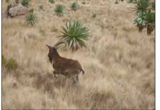
Valia Ibex - Meti04